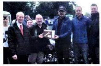
MLC - Best Vehicle In Show Aulern Festival Of Transport 2018

Four guys whose children were all in the same class at the village school, came together through their kids' parties and other local events. The Dads' friendships soon blossomed as they discovered that they had similar interests in good beer and a love of classic cars, so one day rather than just sitting in the pub talking, they decided to do something positive about it.